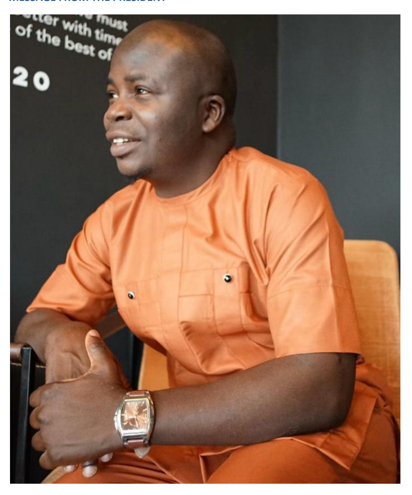
"The best way to find your self is to lose yourself in the service of others." - Mahatma Gandhi